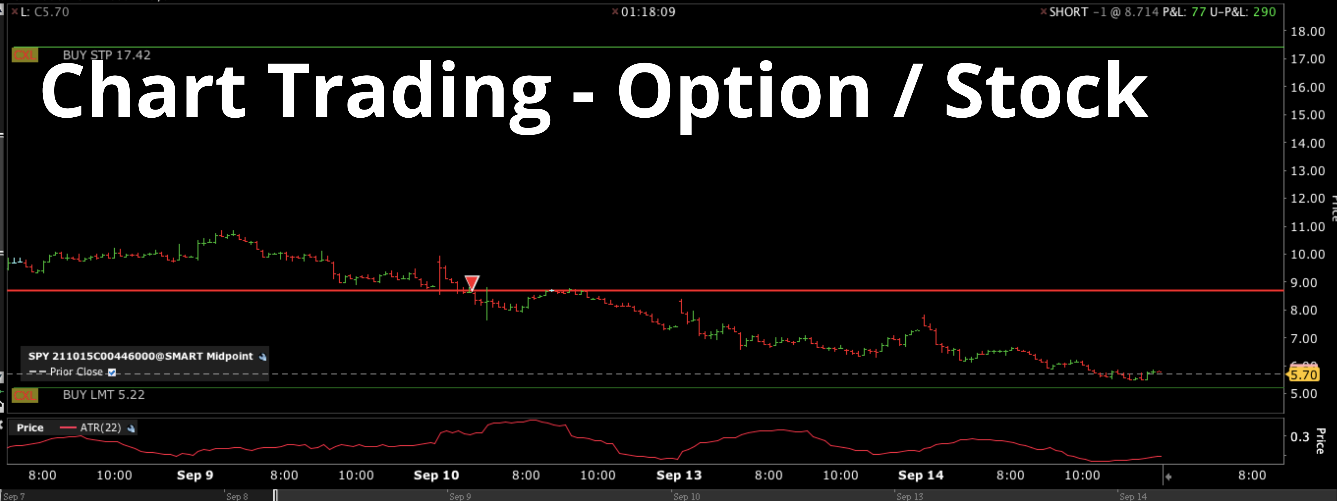
Chart Trading - Option / Stock